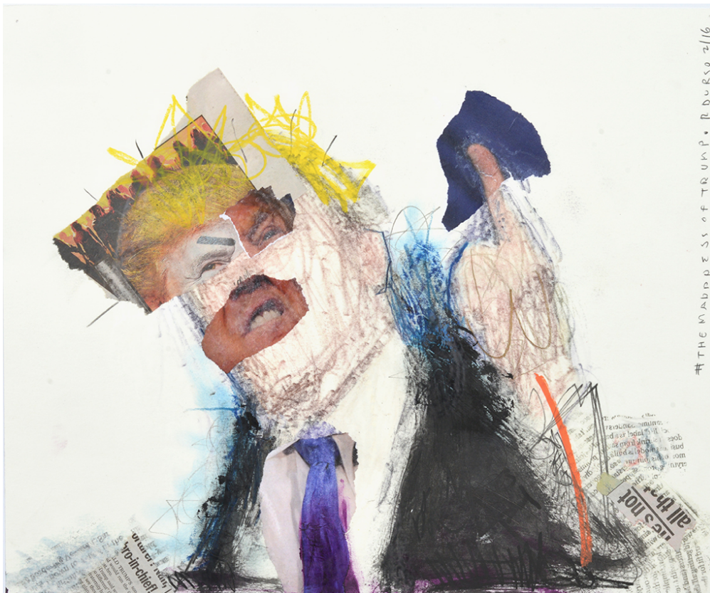
The Madness of Trump! (3), 2016

Mixed Media Collage and Photo Transfer on Paper