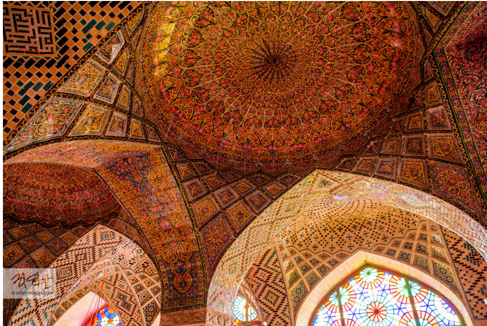
Nasir al-Mulk Mosque, 1888, Shiraz, Iran

Photography has always been a passion of his--he built his own darkroom in the basement of his Dad's office in high school--but architecture school would prove to be all consuming. He put the camera away for several years before picking it back up again when he moved to Europe. Buildings have always been one of his favorite things to photograph, but he finds that travel photography to be equally fascinating. He says he mostly shoots for himself and it's typically "run and gun" shooting, but that he's always thinking about how he would summarize a place in just 10 photographs. He keeps this in mind while he travels.