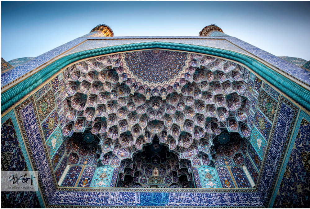
Imam Mosque entrance, 1629, Esfahan, Iran

“In Iran, the level of craftsmanship is extraordinary. The tile is not only hand-made, hand-cut and hand-painted but also it has to fit into these incredibly complex geometries that are also symmetric. The mathematics and the engineering--its incredible.” Coming from our knowledge of churches in the West, he was also fascinated by how minimal the interior of the mosques are. “There’s really nothing to them other than the space--not like a Western church where its glorified with statues and relics of saints. They are just simple spaces meant for prayer.”