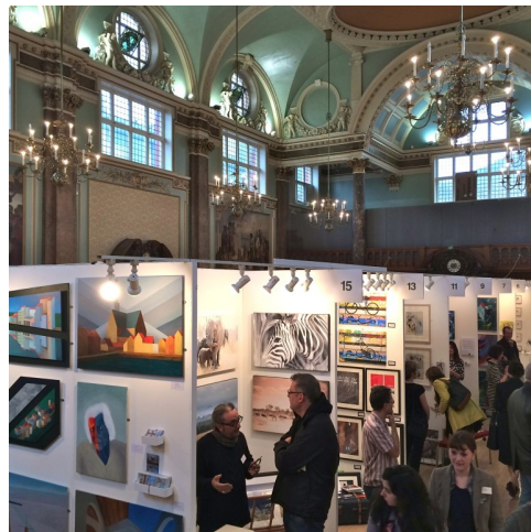
The grand hall at Parallax