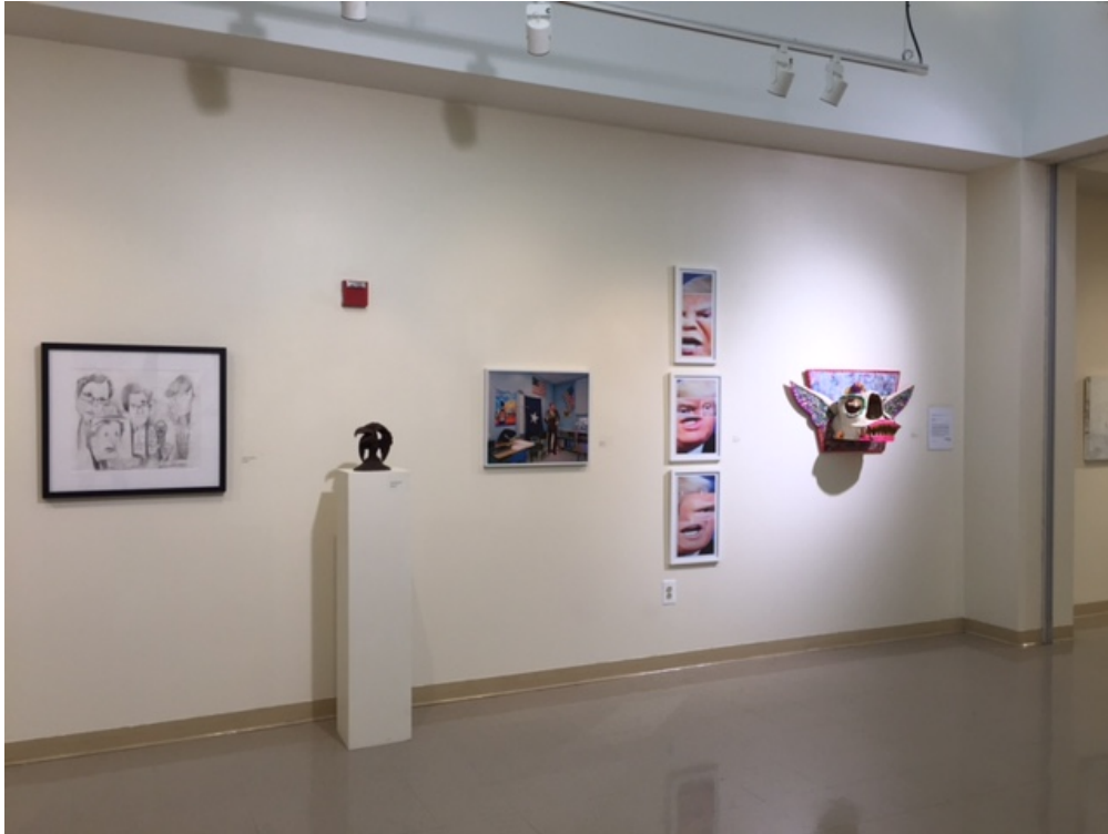
View of "Art Votes: Visualizing the Democratic Process" at Gallery Bergen

Twitter: @LoftArtists | Facebook: /Loftartists