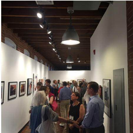
The opening for "Lost + Found"