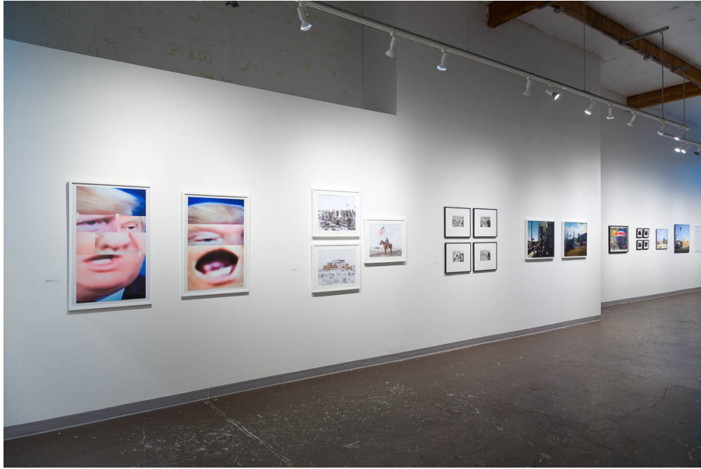
View of "On Democracy" at Newspace Center for Photography

The second exhibition, "On Democracy", was on display at the reputable Newspace Center for Photography in Portland, OR. During this exhibition, Rodney debuted the first of his enlarged archival inkjet prints from his Disconstructing Trump series. "On Democracy", which was curated by Claartje van Dijk, the Assistant Curator of Collections at the International Center for Photography here in New York, was on exhibit during the month of October.