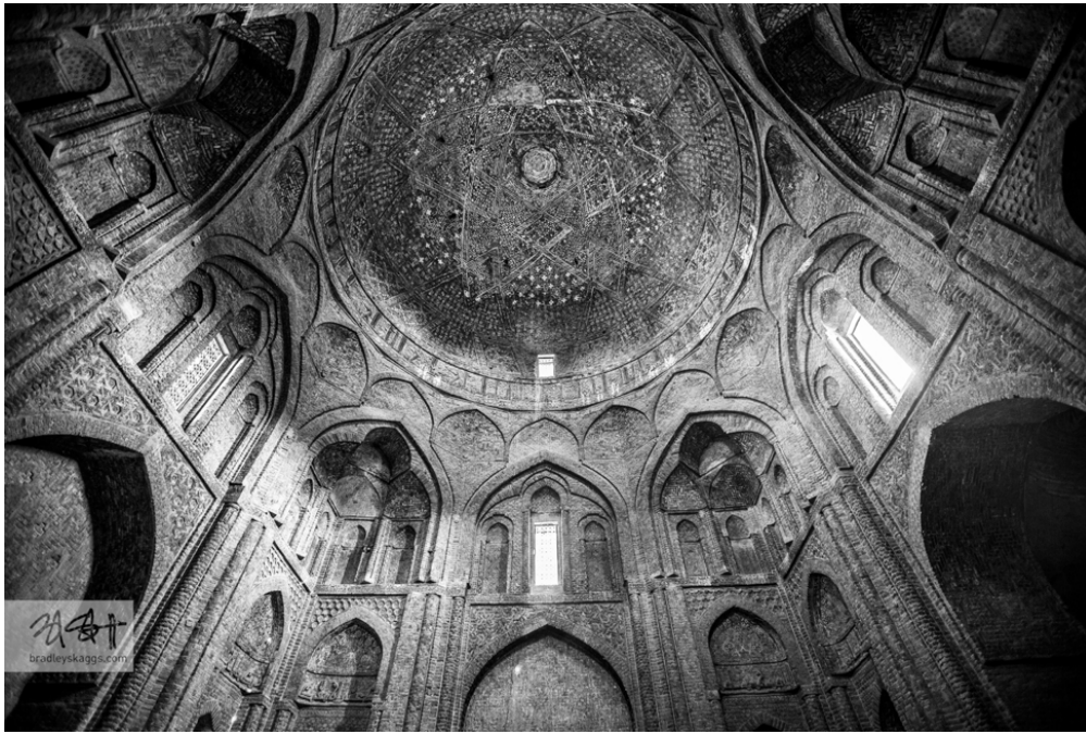
Taj-al-Mulk Mosque, North Dome, built 1088. 4 sides, to 8, to 16 to the dome, Esfahan, Iran